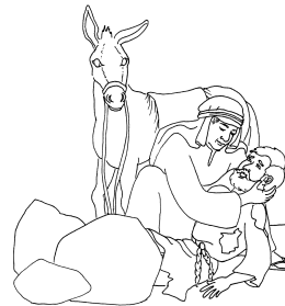
"The good Samaritan has compassion on the man who had been beaten." Luke 10:25-37

R M A A A R T W O N S H H B A H S S U O E D W H N Y A S H E W T A U T E L E L T K O A I P A E N H E T A E M I N V W A E D A M N K M E I T H E R E H I M