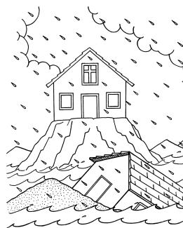
"Therefore whoever hears these sayings of Mine, and does them, I will liken him to a wise man who built his house on the rock." Matthew 7:24

S H U S A E F O M S R O H N E N R N I W O B U S L R E I I E E T O N W W U T T H E H R O T N O P E R D T I T E I V A T I A E D O W O S E E A A S W H T S T H R R C I O C F H E M N L Y K E E A P H I S H T M E M C K H E O E